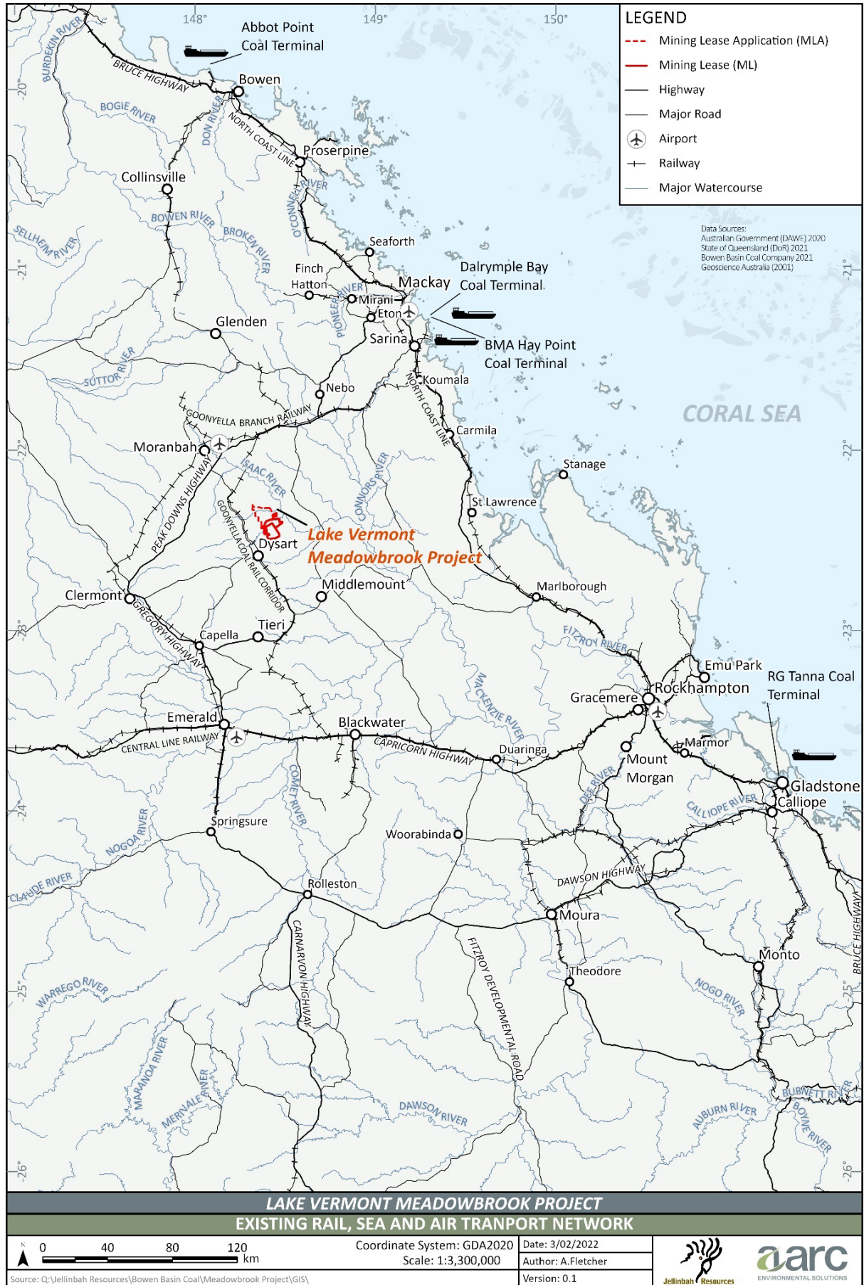
Figure 20.3: Rail, sea and air transport facilities